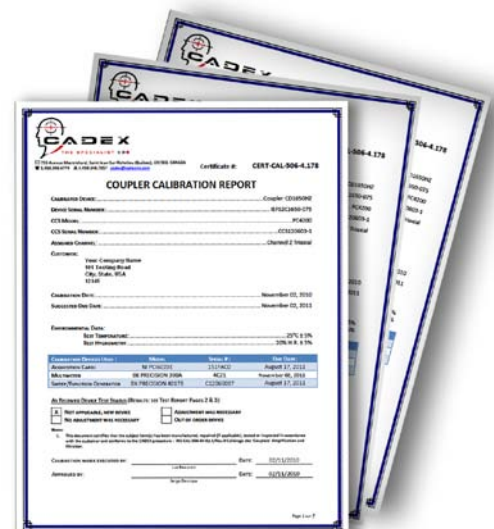
Calibration certificates and reports

Due to continuous improvement on our testing equipment, details shown may change. Cadex Inc reserves the right to make alteration to its products without notice. / rev. July 2011