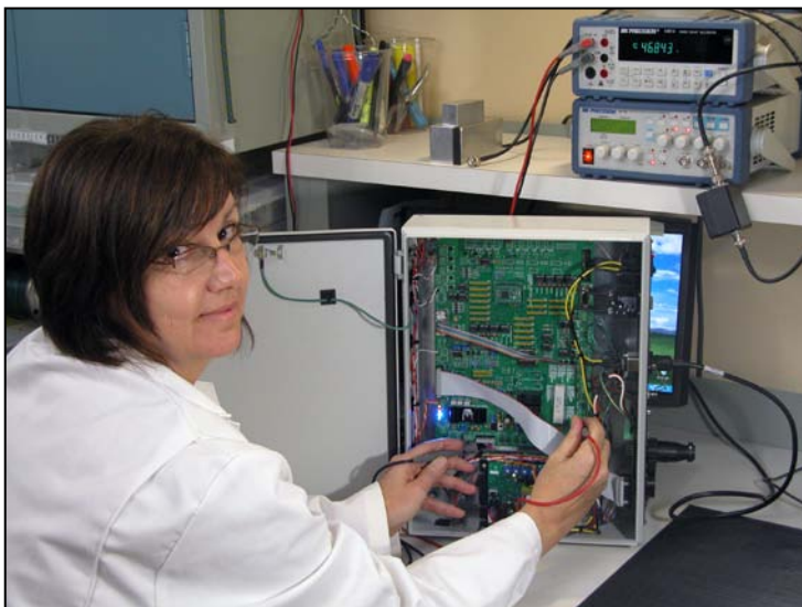
Qualified Electronic Engineers